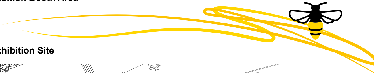
Outdoor Exhibition Site